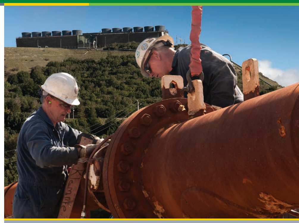
The Geysers field in northern California boasts the largest geothermal complex in the world and the first successful demonstration of EGS technologies in the United States.

Visit the GTO website at geothermal.energy.gov for more information on EGS development, or contact geothermal@ee.doe.gov.