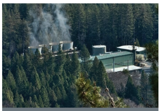
The Geysers field in northern California contains optimal conditions for validating EGS resources.